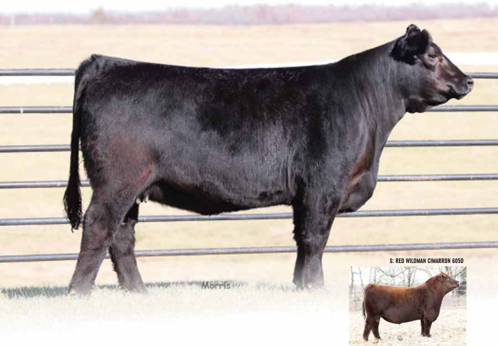
S: RED WILDMAN CIMARRON 605D