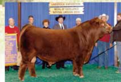
S: MAGSWL USUAL SUSPECT 538U