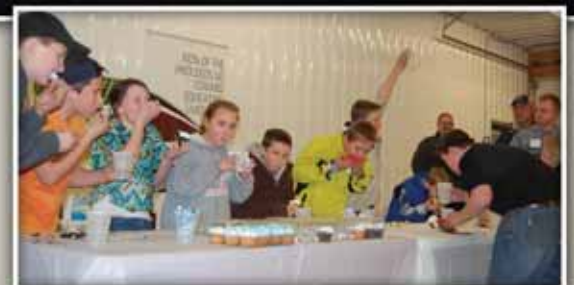
World Championship Cupcake Eating Contest