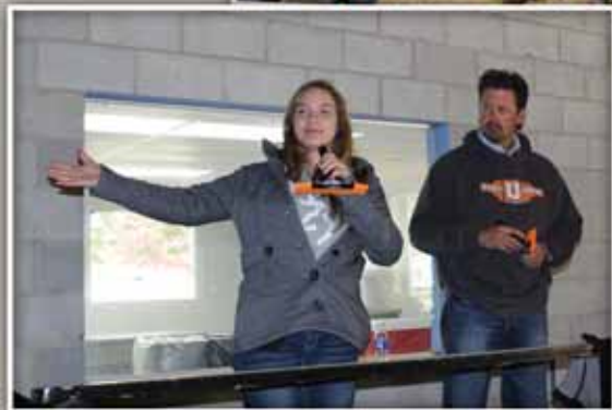
The famous Stock Show U comb stories.